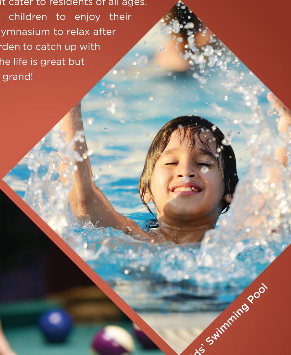
Kids' Swimming Pool